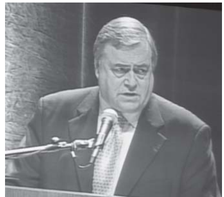
Deputy P.M. of Great Britain John Prescott, a featured speaker at CNU XIV